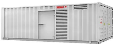
Table 4-17 Battery cabinet technical specifications Favorite Download Document ID:EDOC1100136320 Views:34013 Downloads:2363 Average rating:5.0Points