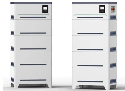
Images of inverter

Step 1: Diagnosis and Identification of The Problem Step 2: Replacing Faulty Components Step 3: Testing and Calibration The final step in repairing a pure sine wave inverter is testing and calibration. This ensures the inverter is functioning correctly and providing the necessary output. a. Initial Power-Up After replacing the faulty components, power up the pure sine wave inverter and observe its operation. Check for any abnormal behavior, such as excessive heat, n See more on inverter Images of Jerusalem Repair Pure Sine Wave Inverter Pure Sine Wave Inverter 1Kv Pure Sinewave Inverter Pure Sine Wave Inverter Wave Inverter 48 Volt Inverter Pure Sine Wave Pure Sine Wave Inverter 48V Inverter Pure Sine Wave 24V Pure Sine Wave Inverter 24 Volt Inverter Pure Sine Wave Modified Sine Wave Power Inverter 3 Steps to Repair Pure Sine Wave Inverter , inverter 3 Steps to Repair Pure Sine Wave Inverter , inverter 3000W Pure Sine Wave Inverter Repair Tips ????? - How to Fix Pure Sine Wave Inverter? , ATO GEHPYYDS 6000W Pure