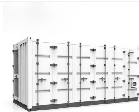
Table 4-17 Battery cabinet technical specifications Favorite Download Document ID:EDOC1100136320 Views:34013 Downloads:2363 Average rating:5.0Points